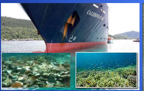
* Ecotourism cruise ship MV Caledonia Sky grounded at Raja Ampat MP, Indonesia